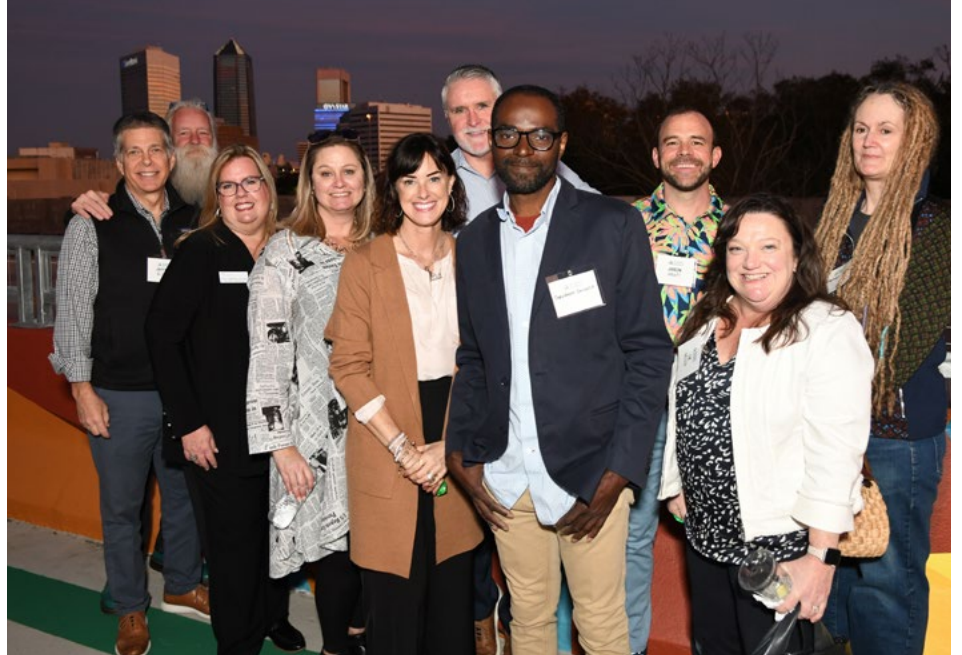
A group of Trailblazers enjoyed the evening with the artist and staff members of Groundwork Jacksonville as the sun set on the walking tour.

Groundwork Jacksonville recognized and celebrated its donors at a Jan. 30 Trailblazers event at 927 Events.